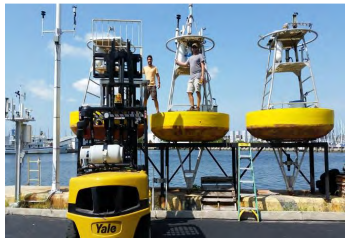
Updating buoy sensors in Ft. Myers, Florida

Whether it is the nation's nautical charts, environmental monitoring, or socioeconomic tools, NOS and its partners integrate science and services to provide actionable intelligence. Knowledgeable decision makers, both public and private, are able to make informed choices on their use and stewardship of coastal resources to better address threats to coastal areas such as climate change, population growth, and port congestion.