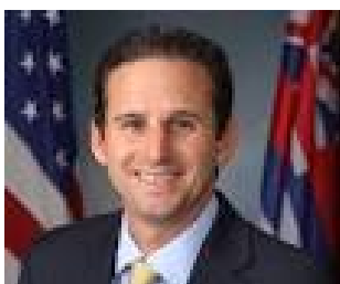
U.S. Senator, Hawai’i