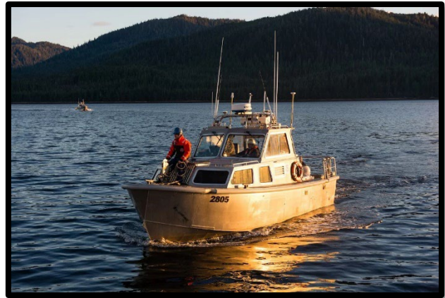
Recreational Boater

Nautical charts are foundational components of every mariner's toolkit. Navigation requires a knowledge of how the earth's surface is represented on either a printed paper chart or on the screen of an electronic navigation system. Both forms of navigation require the navigator to understand the symbols, numeric notations, language used, and how the graphic presentation relates to a physical position on the earth. Mariners who do not understand how to use nautical charts, paper or electronic, significantly decrease their ability to navigate safely. The study of navigation usually begins with discussion of the printed chart. How is direction indicated? How is distance measured? What do the various symbols and abbreviations stand for? How do latitude and longitude provide a position? Is the information current and accurate? Digital navigation tools can eliminate a significant amount of tedious work when used properly. Route planning is simplified, waypoints can be automatically uploaded to steering systems, travel time and fuel consumption can be estimated, and potential hazards can be marked with alarms or routed around.