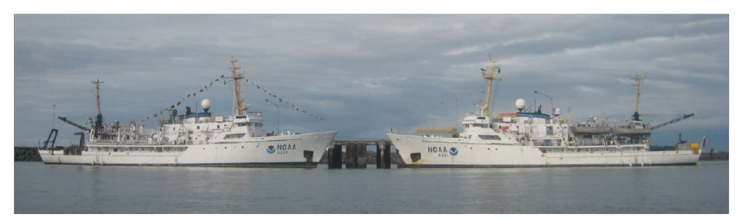
NOAA ships Rainier and Fairweather were built in 1968 with an original design life of 30 years. Each ship carries five survey launches. Dedicated ships carrying multiple survey launches are one of the most efficient and cost-effective ways to conduct hydrographic surveys. Both vessels still conduct annual surveys in challenging Alaskan and Arctic waters.