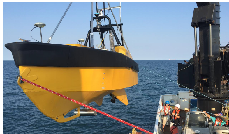
Operational evaluation of a USV during a bathymetric and marine habitat survey offshore of the Carolinas.

Personnel Management - with automation, workforce can focus on tasks that require their expertise, rather than on repetitive, laborious tasks