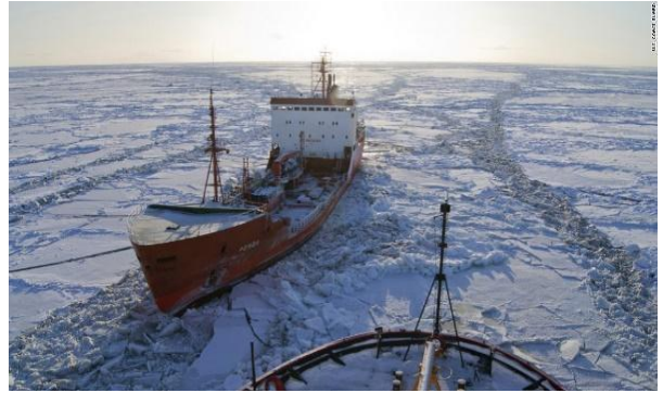
Russian oil tanker SIMUSHIR being escorted through Bering Sea ice by the U.S. Coast Guard icebreaker HEALY.