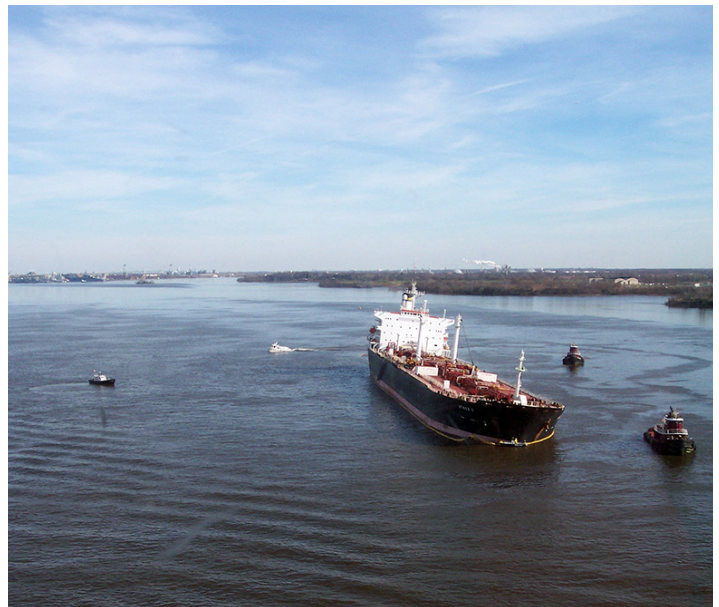
Why Object Detection is Important. Tanker Athos was punctured by a 9-ton anchor in a federal anchorage area, causing approximately 264,000 gallons of crude oil to spill into the Delaware River in November 2004. 2

typically use multibeam data, which can be suitable for IHO compliance; however, multibeam surveys must be planned and executed appropriately to meet Special Order or Order 1a requirements. The assumption for channel management and maintenance after the "new work" survey is that, because an active channel has been deepened with 100% coverage to authorized depth and width, any future surveys are seen as "condition" surveys to determine maintenance dredging needs and location of natural shoals. For these surveys, USACE typically performs more frequent single-beam "condition" and other types of surveys on navigable