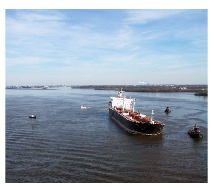
Why Object Detection is Important. Tanker Athos was punctured by a 9-ton anchor in a federal anchorage area, causing approximately 264,000 gallons of crude oil to spill into the Delaware River in November 2004.

typically use multibeam data, which can be suitable for IHO compliance; however, multibeam surveys must be planned and executed appropriately to meet Special Order or Order 1a requirements. The assumption for channel management and maintenance after the "new work" survey is that, because an active channel has been deepened with 100% coverage to authorized depth and width, any future surveys are seen as "condition" surveys to determine maintenance dredging needs and location of natural shoals. For these surveys, USACE typically performs more frequent single-beam "condition" and other types of surveys on navigable